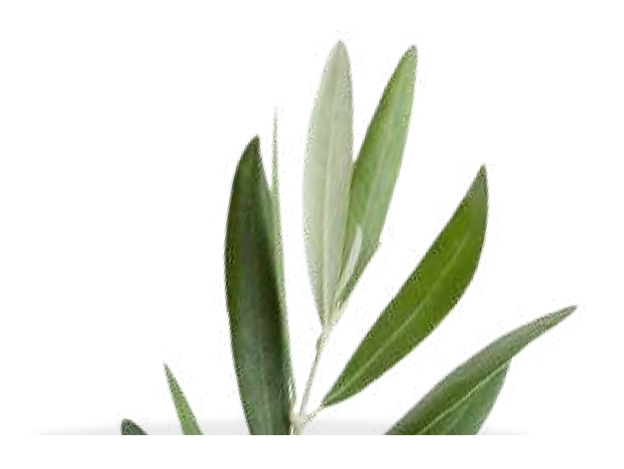
FUEL YOUR BODY AND SOUL